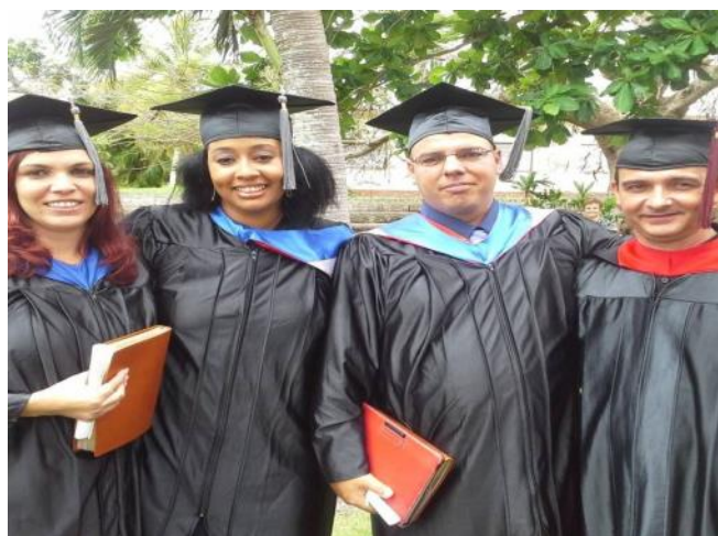
Some of SET's June graduates