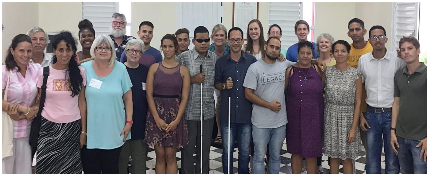
An inspiring and encouraging encounter with the students at SET