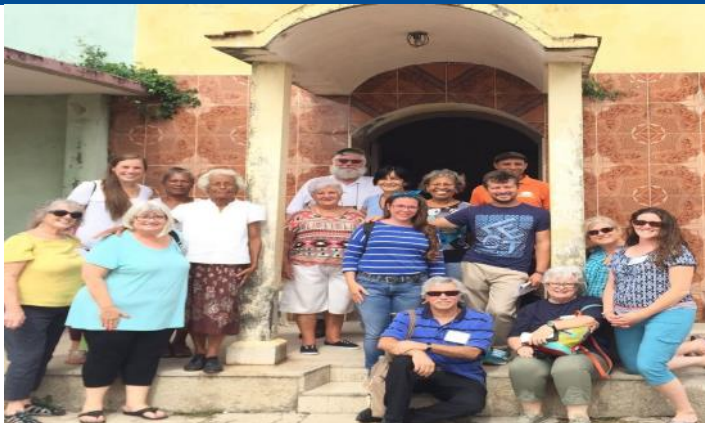
Our team on the steps of Resurrection Church in Sabanilla