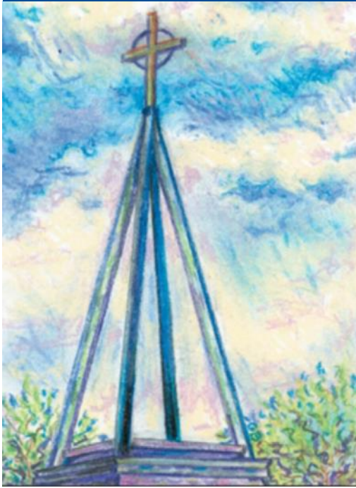
Boundless Grace by Ginger Boys