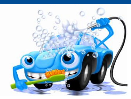
All freewill donations will support the Dressed for School Program.

Saturday, June 3, 2023 8:00 a.m. – 12:00 p.m. First Presbyterian Church 3401 N Valparaiso St Valparaiso, IN 46383